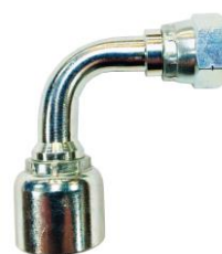
90° Tube Bend