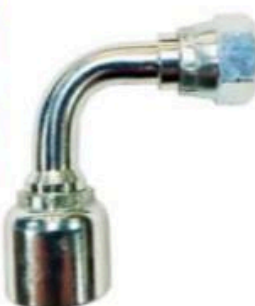
JIC 90° Female Tube Bend