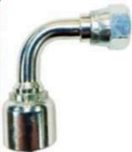
ORFS 90° Female Tube Bend