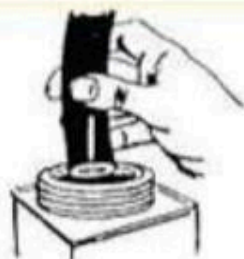
Lubricate Hose Thoroughly

* FOR SAFETY REASONS DO NOT MIX DIFFERENT BRANDS OF BODIES AND TAILS ASSEMBLY INSTRUCTIONS FOR FIELD ATTACHABLE HOSE FITTINGS