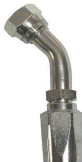
45° Tube Bend ORFS