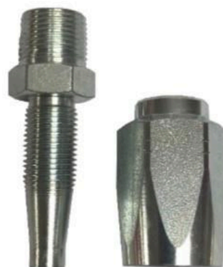
Straight Male BSPT