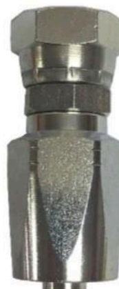
Straight Female BSP