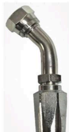
45° Tube Bend JIC