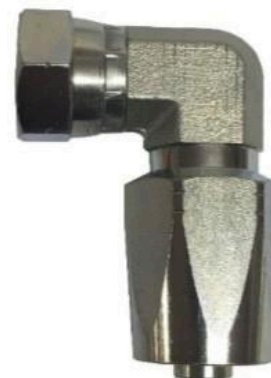
90° Elbow JIC