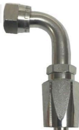
90° Tube Bend ORFS