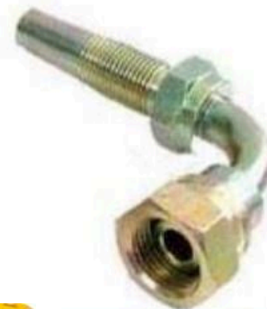
90° Female Elbow