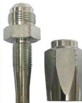
Straight Male JIC