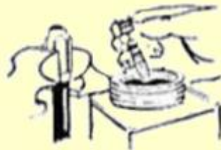
Lubricate nipple thoroughly