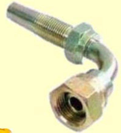
90° Female Elbow