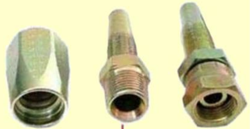
Outer Body Male Nipple Female Swivel

FOR SAFETY REASONS DO NOT MIX DIFFERENT BRANDS OF BODIES AND TAILS ASSEMBLY INSTRUCTIONS FOR FIELD ATTACHABLE HOSE FITTINGS