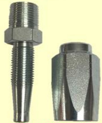
Straight Male BSPT