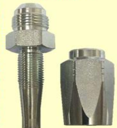
Straight Male JIC