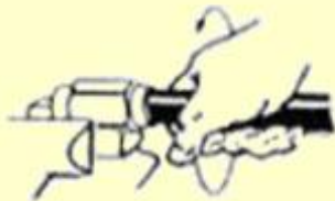
Place socket in vice as shown. Thread hose counter clock-wise into socket until hose bottoms. Back off 1/2 turn.