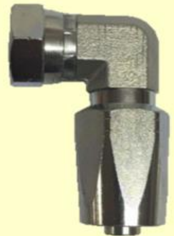
90° Elbow JIC