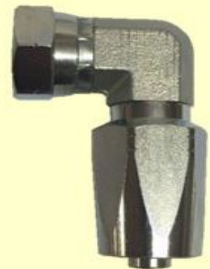
90° Elbow BSP