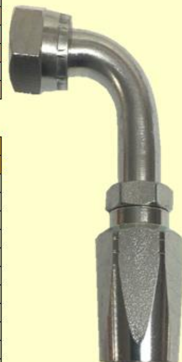
90° Tube Bend ORFS