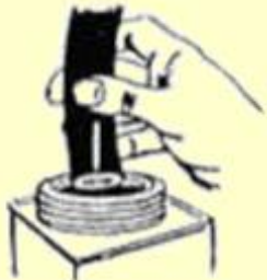
Lubricate Hose Thoroughly

FOR SAFETY REASONS DO NOT MIX DIFFERENT BRANDS OF BODIES AND TAILS ASSEMBLY INSTRUCTIONS FOR FIELD ATTACHABLE HOSE FITTINGS