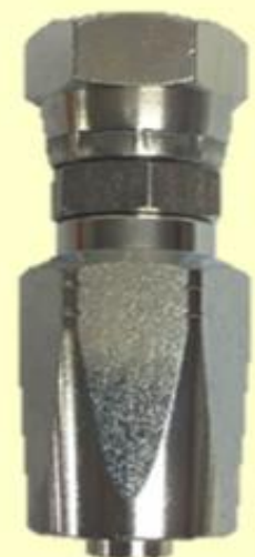
Straight Female ORFS