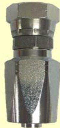
Straight Female BSP