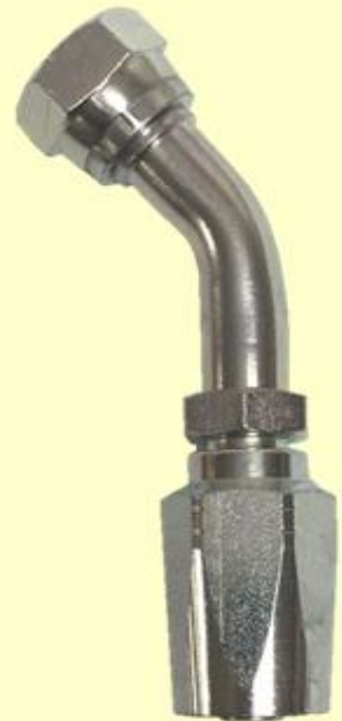
45° Tube Bend JIC