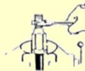
Thread nipple clockwise