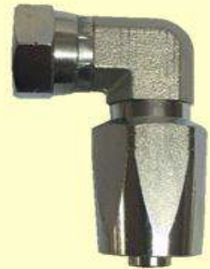
90° Elbow BSP