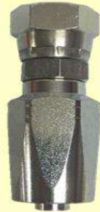
Straight Female BSP