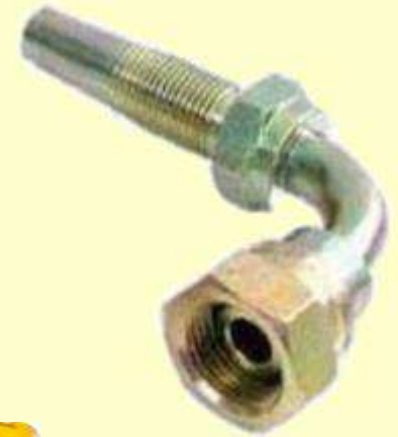
90° Female Elbow