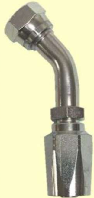
45° Tube Bend JIC