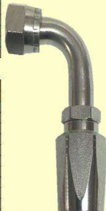
90° Tube Bend ORFS