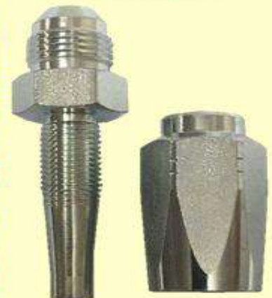
Straight Male JIC