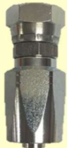
Straight Female ORFS