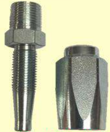
Straight Male BSPT