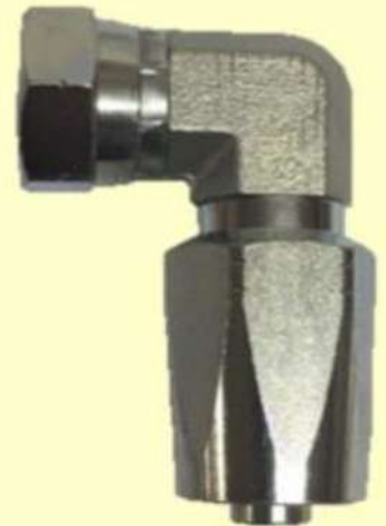
90° Elbow JIC