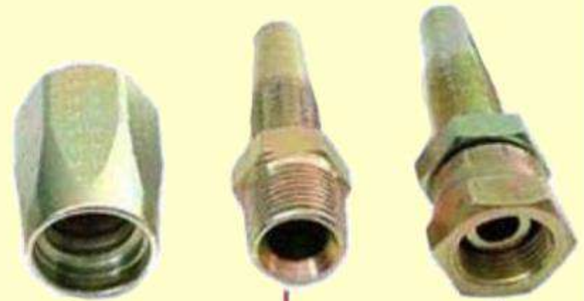
Outer Body Male Nipple Female Swivel

FOR SAFETY REASONS DO NOT MIX DIFFERENT BRANDS OF BODIES AND TAILS ASSEMBLY INSTRUCTIONS FOR FIELD ATTACHABLE HOSE FITTINGS