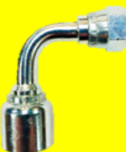
JIC 90° Female Tube Bend