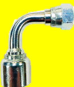
ORFS 90° Female Tube Bend