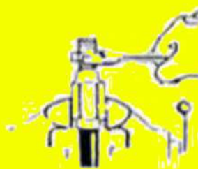
Thread nipple clockwise