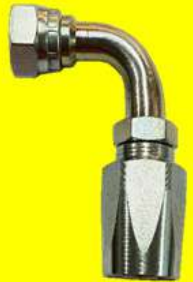
BSP 90° Tube Bend