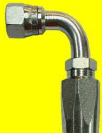
JIC 90° Tube Bend