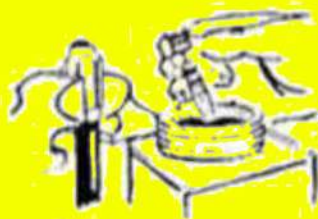
Lubricate nipple thoroughly