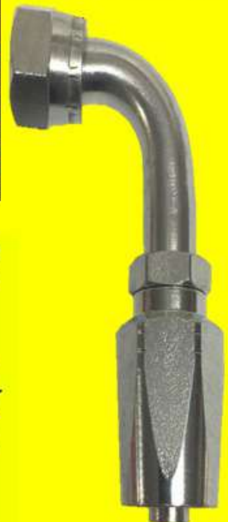
90° Tube Bend ORFS