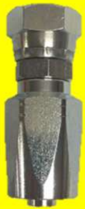
Straight Female ORFS