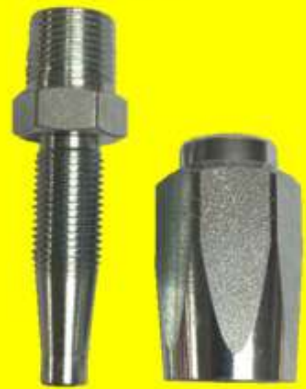
Straight Male BSPT