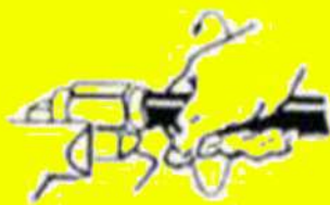
Place socket in vice as shown. Thread hose counter clock-wise into socket until hose bottoms. Back off 1/2 turn.