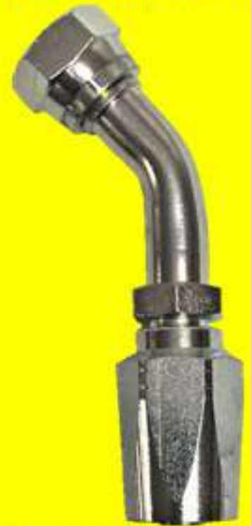
45° Tube Bend ORFS