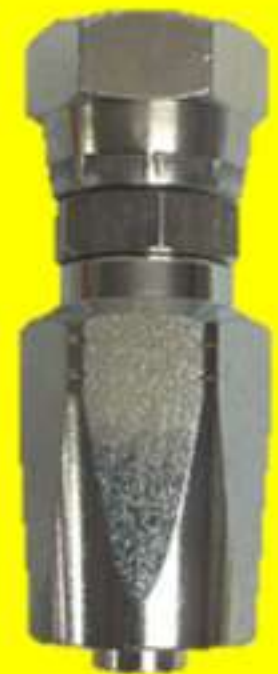
JIC Female Straight