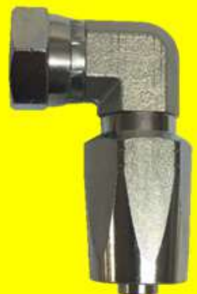
90° Elbow BSP