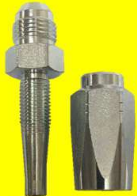
Straight Male JIC