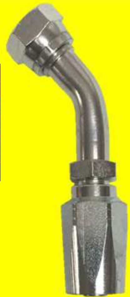
45° Tube Bend JIC