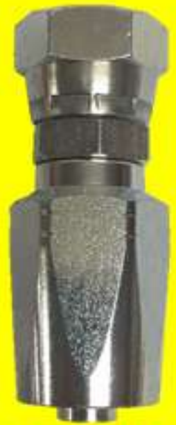
Straight Female BSP