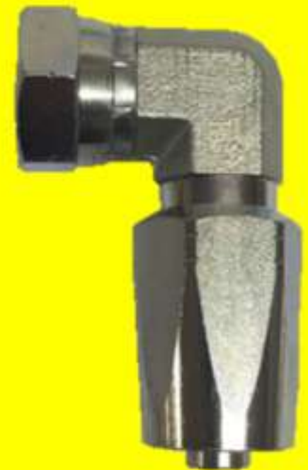
90° Elbow JIC