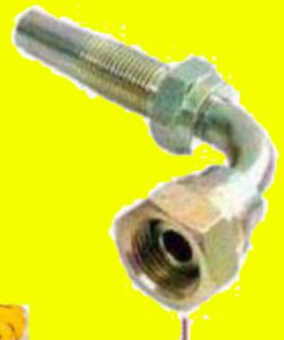
90° Female Elbow