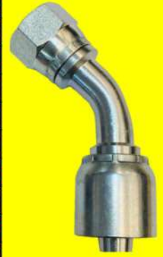
JIC 45° Tube Bend