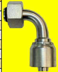
DKOL Metric 90° Tube Bend