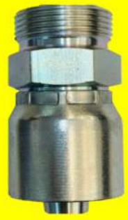
DKL Metric Male