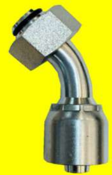
DKOL Metric 45° Tube Bend