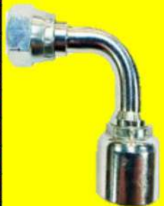
JIC 90° Tube Bend