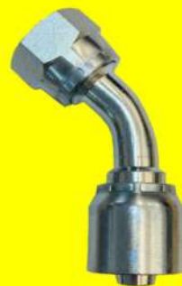
ORFS 45° Tube Bend