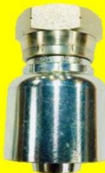
Four Wire JIC Female