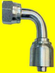
ORFS 90° Tube Bend