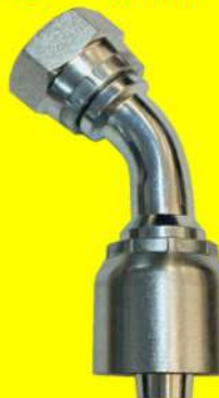
BSP 45° Tube Bend