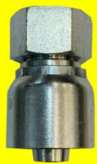
DKOL Metric Female