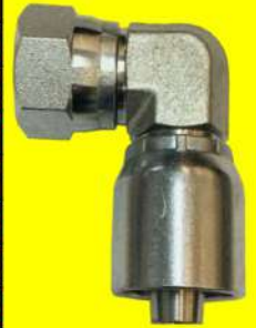
JIC 90° Elbow