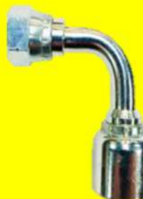
BSP 90° Tube Bend