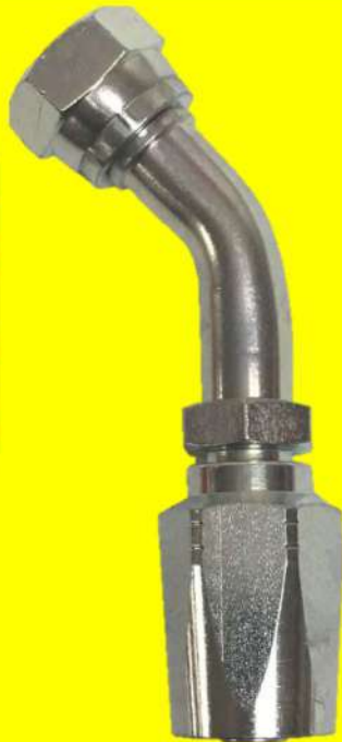
45° Tube Bend JIC