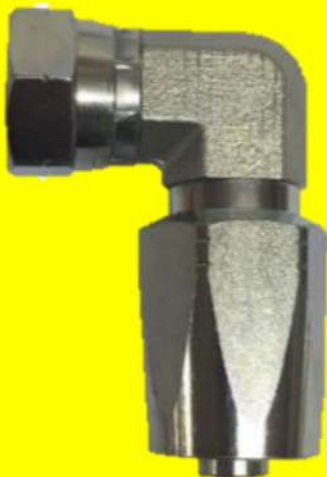
90° Elbow JIC