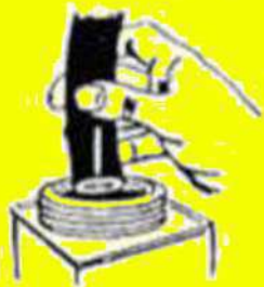
Lubricate Hose Thoroughly

FOR SAFETY REASONS DO NOT MIX DIFFERENT BRANDS OF BODIES AND TAILS ASSEMBLY INSTRUCTIONS FOR FIELD ATTACHABLE HOSE FITTINGS