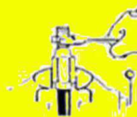
Thread nipple clockwise