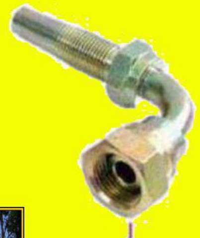
90° Female Elbow