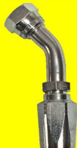
BSP 45° Tube Bend