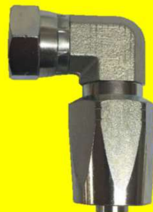
90° Elbow BSP