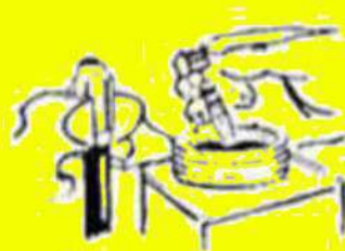
Lubricate nipple thoroughly