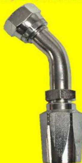
45° Tube Bend ORFS