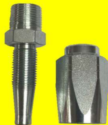
Straight Male BSPT