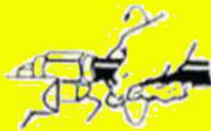
Place socket in vice as shown. Thread hose counter clock-wise into socket until hose bottoms. Back off 1/2 turn.