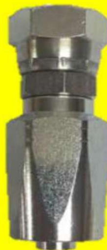
Straight Female ORFS