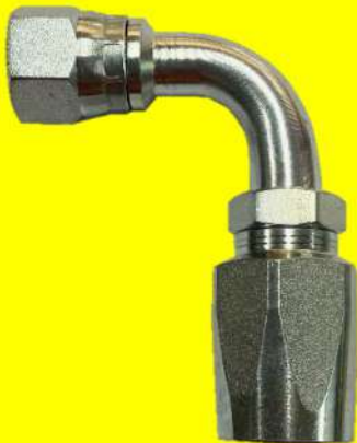
JIC 90° Tube Bend