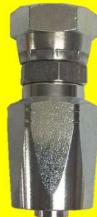
Straight Female BSP