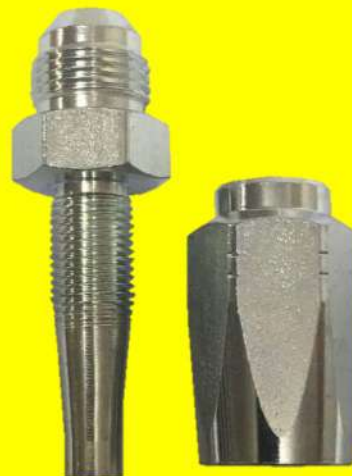
Straight Male JIC