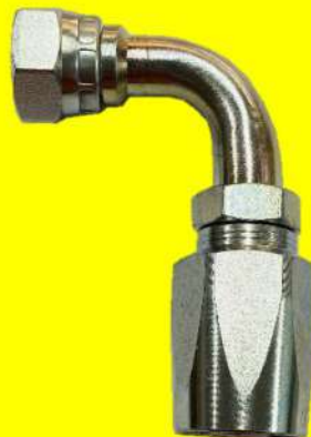
BSP 90° Tube Bend